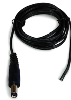
NALTL-10 / NALTL-30 Power Line Connector (10' included)