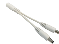
NATL-302W Power Line Splitter